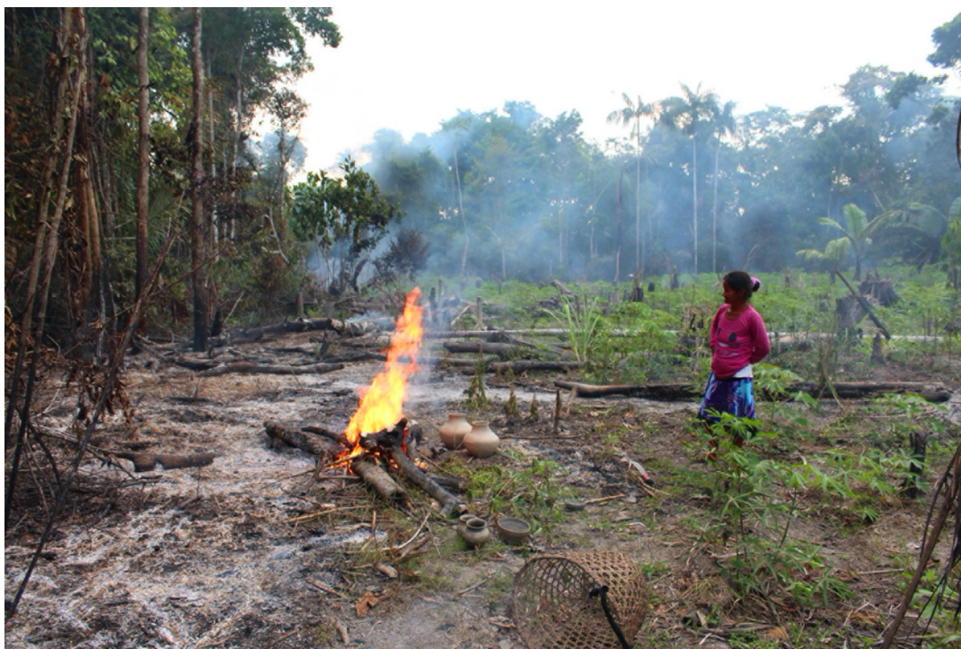
figure 6. Gladiz firing ceramics.

audiovisual workshop, and that they liked to take photos. They also expressed pride in the knowledge Erlinda shared with the group, noting in one of the group discussions that “the grandmother Erlinda is an example for the community” 2 . In one of the photos that served as a discussion prompt, a group of teenaged girls sat watching Gladiz mold a ceramic vessel. In responding to the photo, a group of workshop participants mentioned that the image “makes