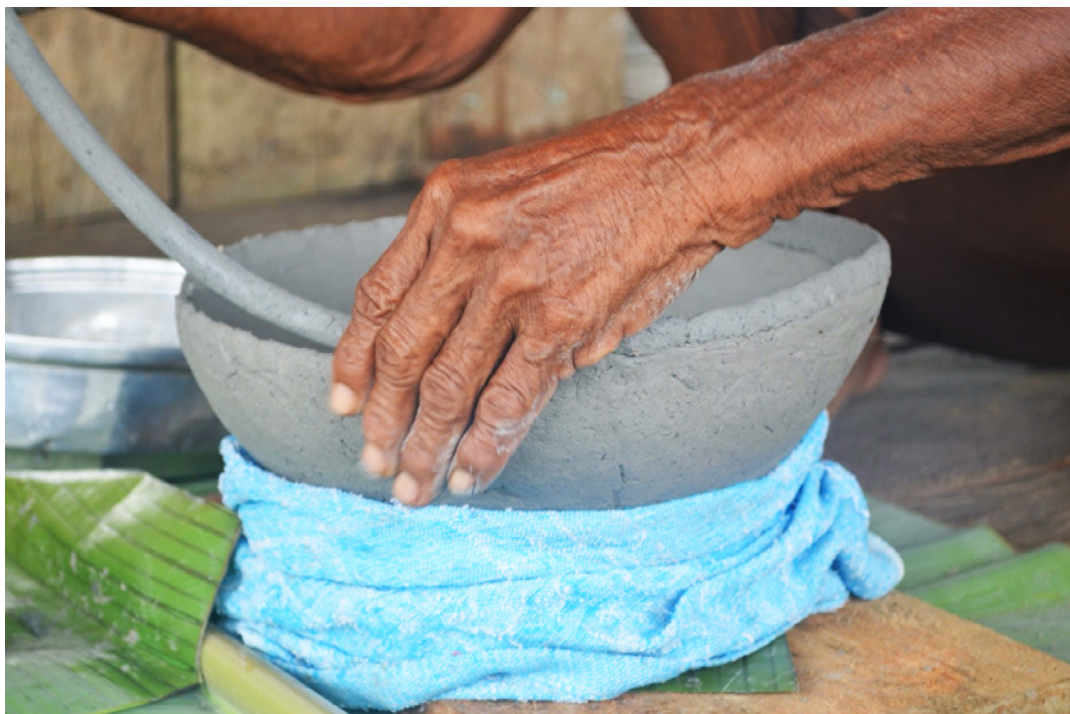
figure 5. Erlinda forming a vessel

2. La abuelita Erlinda es un ejemplo para la comunidad de Bufo Cocha.”